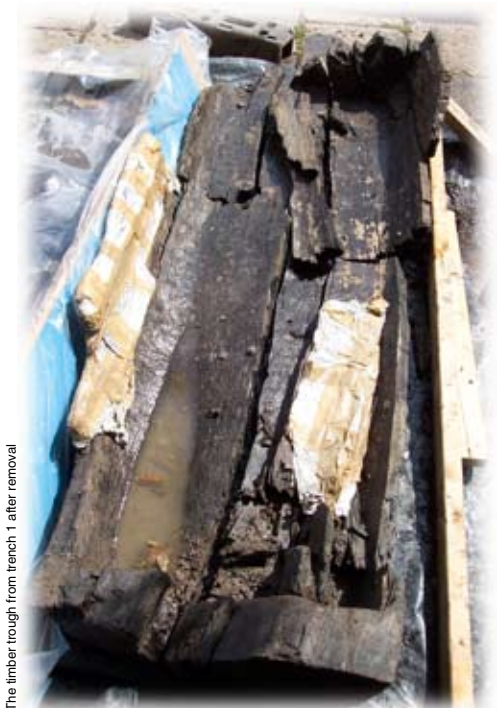
The timber trough from trench 1 after removal

Towards the end of the trench 1 excavations an impressive timber trough was revealed. This had been pegged into place with wooden uprights and was set behind a wicker fence running parallel with the edge of the River Frome. The archaeologists and timber experts have had fun pondering its possible uses, which include dugout canoe and trough for collecting water for rope making. In reality it may have been re-used for a number of different purposes during its lifetime, but traces of mortar on the inside of it suggest it was used at some stage for mixing mortar for building.