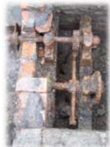
pumping mechanism in Trench 2

The trough was lifted as carefully as possible from the trench at the end of the excavation, although ancient fractures in the wood caused it to break into several large pieces. These have now been wrapped in plastic to prevent the waterlogged timbers from drying out, and will be drawn and photographed before going through a lengthy conservation and reassembly process. Ultimately it will be put on display at Bristol Museum.