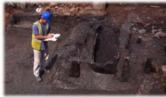
timber trough in Trench 1