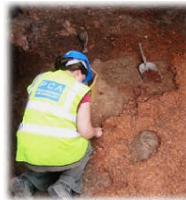
recording tile impressions in the friary church

As well as long-standing boundary walls between buildings established in the 12th/13th century, Trench 2 revealed lots of stone drains between the properties that would have carried rainwater away into the River Frome. Also found was an intriguing 19th-century pumping mechanism for raising water from a well, and the edge of the culvert through which the River Frome passed until the middle of the 20th-century. The new drainage trench around the north side of Quakers Friars has revealed the remains of tiled floor surfaces of the church belonging to the Dominican Friary.