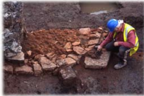
stone hearth in Trench 1

Excavations in trenches 1 and 2 are now complete. These again revealed buildings possibly as early as 12th-century in date extending back from Broad Weir to the former course of the River Frome. Within trench 1 several stone hearths were found which might have served a number of uses, including heating vats for dyeing cloth, baking, and metalworking.